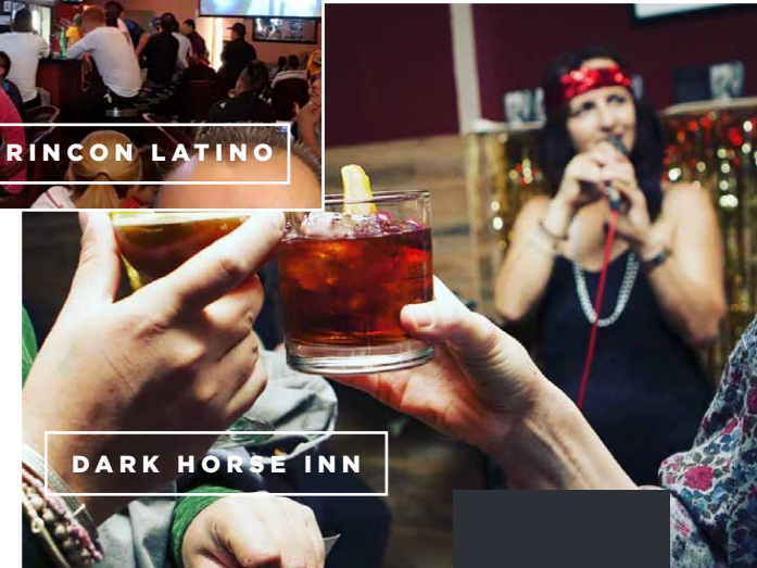
DARK HORSE INN