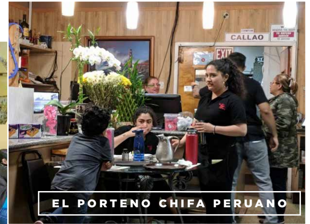
EL PORTENO CHIFA PERUANO