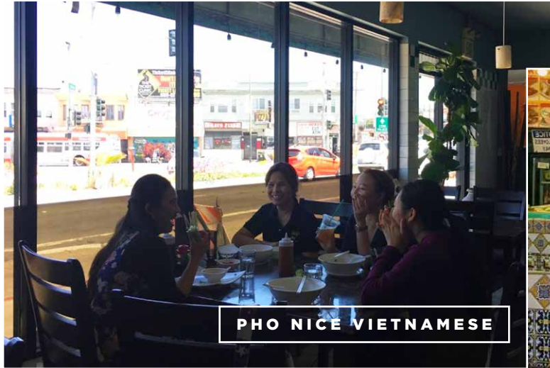
PHO NICE VIETNAMESE