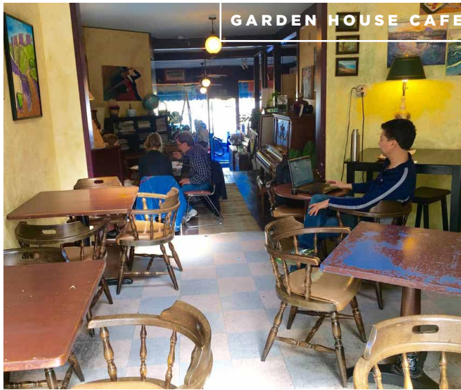
GARDEN HOUSE CAFE