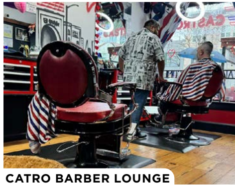
CATRO BARBER LOUNGE