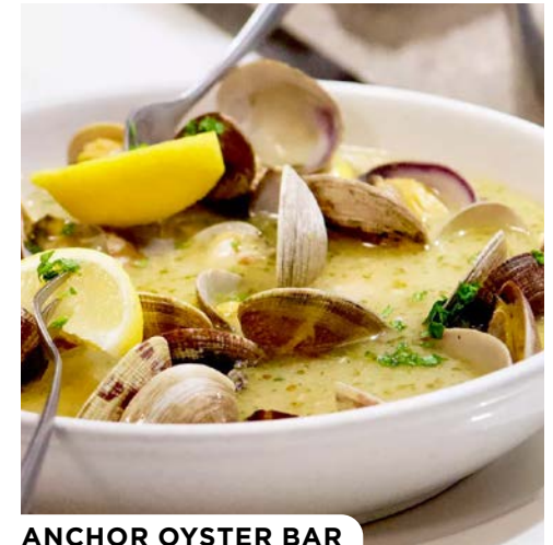
ANCHOR OYSTER BAR