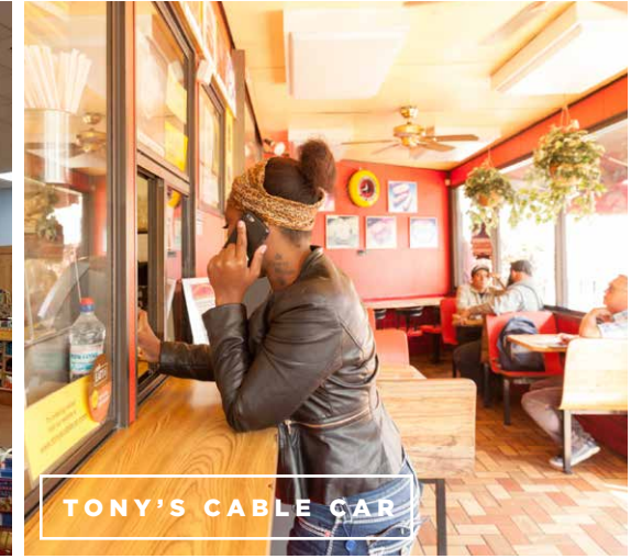
TONY'S CABLE CAR