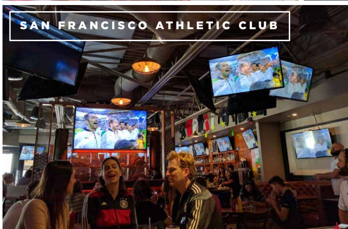
SAN FRANCISCO ATHLETIC CLUB