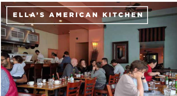
ELLA'S AMERICAN KITCHEN