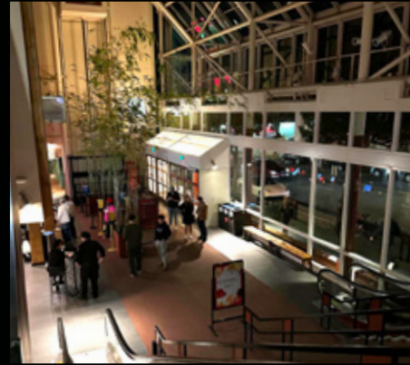
AMC KABUKI 8