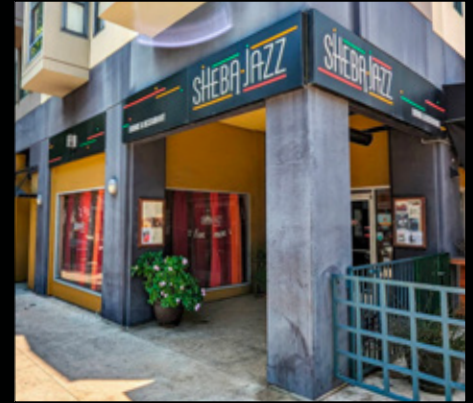
SHEBA JAZZ LOUNGE