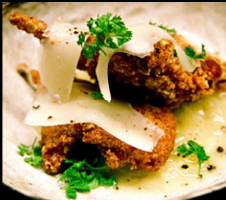
STATE BIRD PROVISIONS