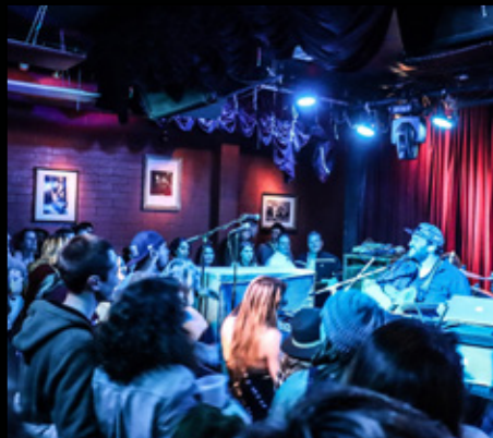
BOOM BOOM ROOM