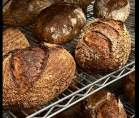
JANE THE BAKERY