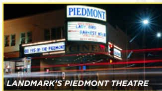
LANDMARK'S PIEDMONT THEATRE