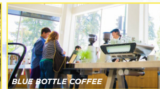
BLUE BOTTLE COFFEE