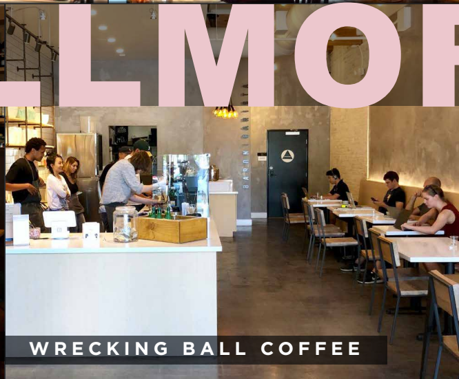
WRECKING BALL COFFEE