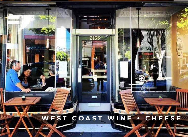
WEST COAST WINE • CHEESE