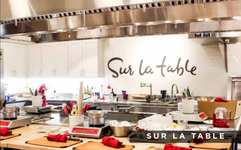
SUR LA TABLE