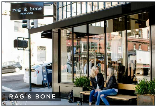
RAG & BONE