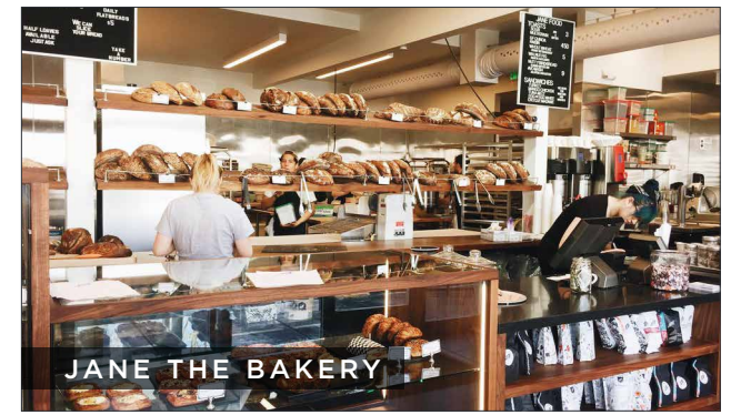
JANE THE BAKERY