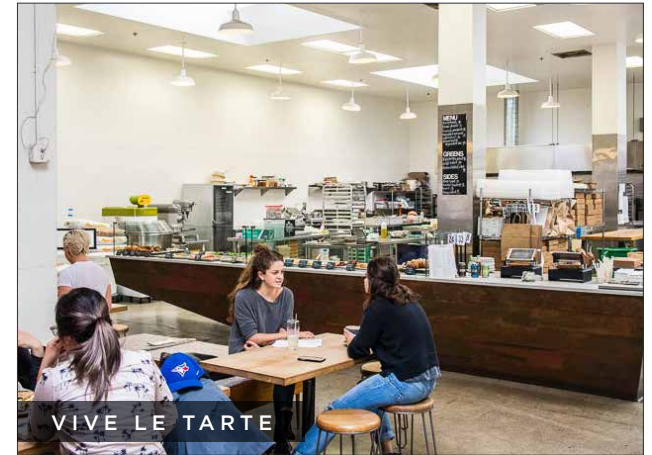
VIVE LE TARTE