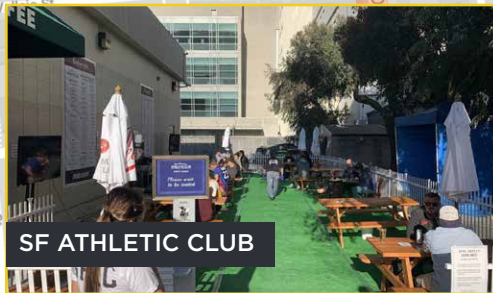
SF ATHLETIC CLUB