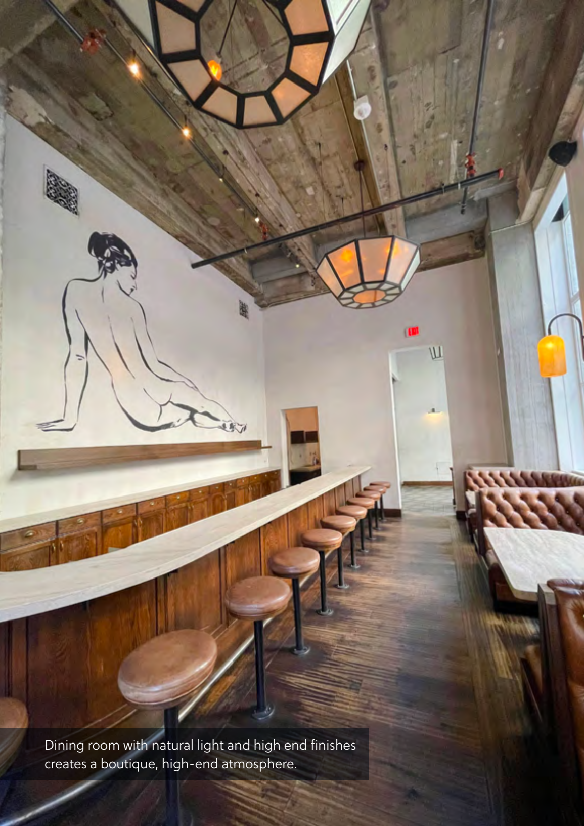
Dining room with natural light and high end finishes creates a boutique, high-end atmosphere.