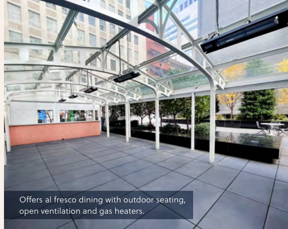
Offers al fresco dining with outdoor seating, open ventilation and gas heaters.