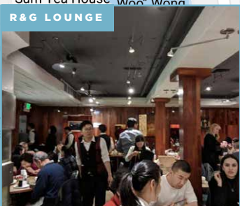
Sum Tea House R&G LOUNGE