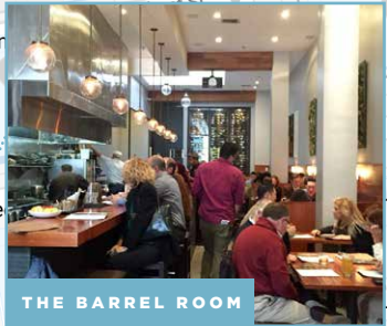
THE BARREL ROOM