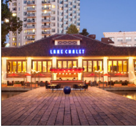
LAKE CHALET SEAFOOD GRILL