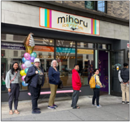
MIHARU ICE CREAM