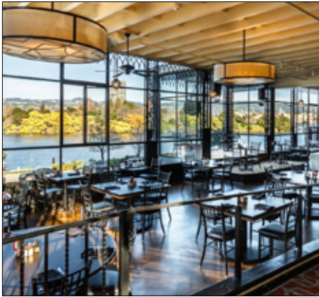
THE TERRACE ROOM