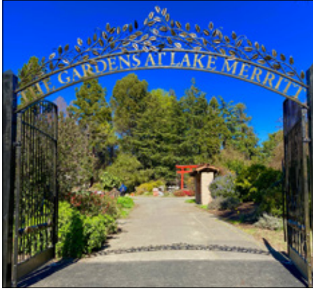
LAKESIDE PARK GARDEN