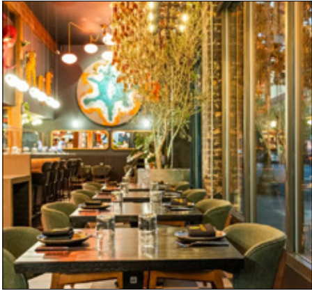
LUCUMA KITCHEN & BAR