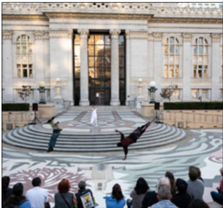
OAKLAND CITY HALL