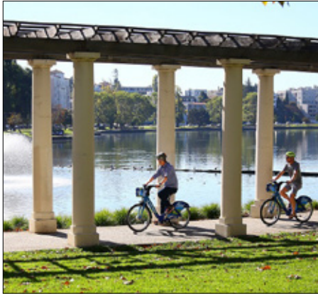
LAKE MERRITT PATH