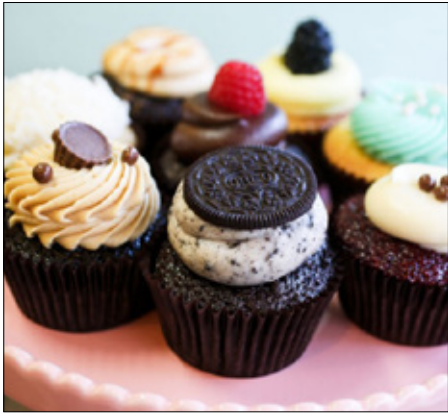
CUPCAKIN' BAKE SHOP