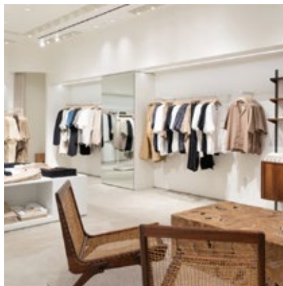
OAK + FORT

Located in the heart of San Francisco, the Upper Market neighborhood offers easy access to local attractions, as well as quick transportation to many of the most well-known San Francisco landmarks. Considered one of the most burgeoning areas in San Francisco, Hayes Valley's rapid ascent as one of the Bay Area's hippest neighborhoods can be attributed to the vast array of high-end boutiques, restaurants, and bars that populate the city plaza