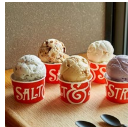
SALT & STRAW