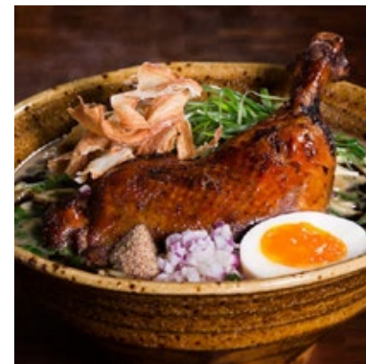
NOJO RAMEN TAVERN