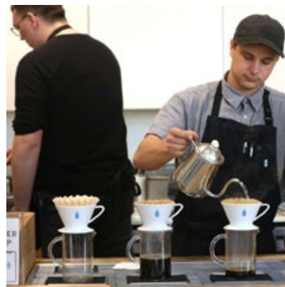
BLUE BOTTLE COFFEE