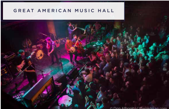
GREAT AMERICAN MUSIC HALL