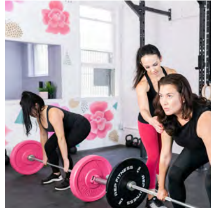
IRON + METTLE