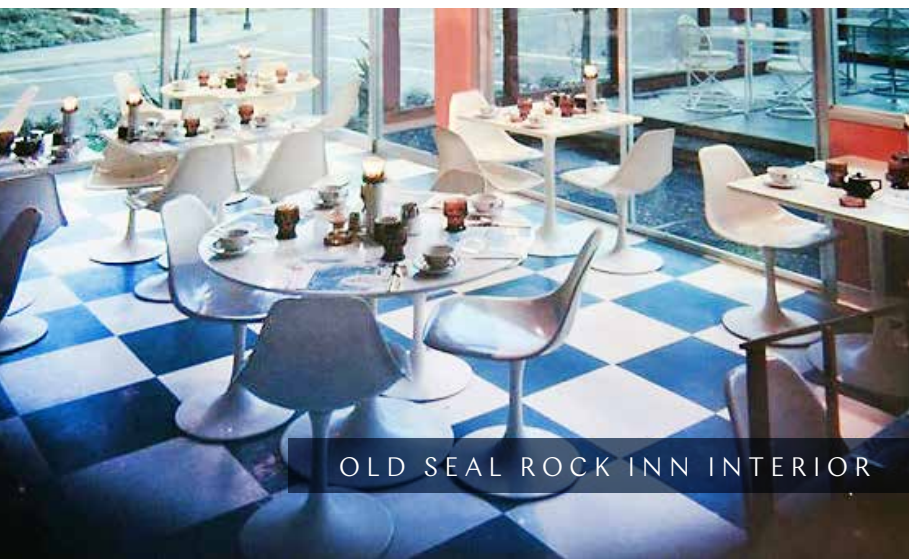
OLD SEAL ROCK INN INTERIOR