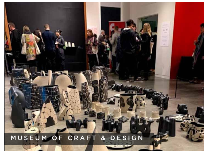
MUSEUM OF CRAFT & DESIGN