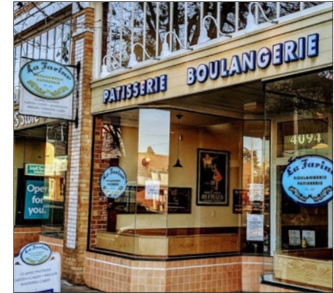
LA FARINE BAKERY