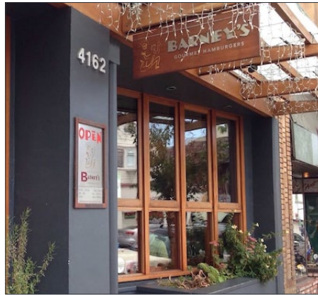
BARNEY'S GOURMET HAMBURGERS

Piedmont Avenue is one long sidewalk of restaurants, shops and services, stacked side by side, with nearly nothing vacant. Choices range from family-friendly, 1894-founded Fentons Creamery, which made a cameo in Pixar's Up, and the Michelin-starred Commis (2009). Indie films screen at Oakland's longest running cinema, the Piedmont Theatre, while at the more modern Cato's Ale House, sports screen on TVs as taps pour craft beers. Despite being part of the big city and having a high density of stores, Piedmont Avenue is very small-town, with a genuine magazine stand, a sewing shop with lessons (Sew Images) and a tobacconist (Piedmont Tobacconist).