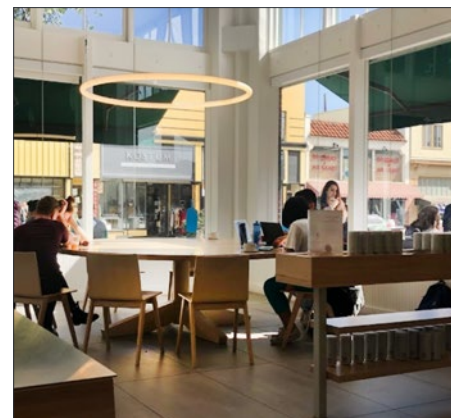
BLUE BOTTLE COFFEE