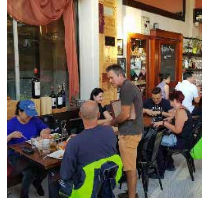
TONY'S PIZZA NAPOLETANA

There is so much colorful history bound up in North Beach and so much activity. Often referred to as San Francisco's Little Italy, North Beach features some of the City's best architecture and is situated alongside San Francisco's Russian Hill, Waterfront, Chinatown, and Jackson Square neighborhoods. Both locals and visitors appreciate the crackling mix of restaurants, bars, coffee shops, bakeries, nightclubs, and book shops that line the neighborhood. North Beach is anchored by Washington Square Park, which serves as the main gathering place and enjoys views of Coit Tower. Grant Avenue and Columbus Avenue are the two main commercial corridors, both rich with one-of-a-kind shops, restaurants and bars such as Original Joes, City Lights Bookstore, Tony's Pizza Napoletana, Victoria Pastry, and more.