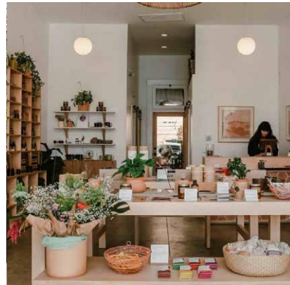
P.F. CANDLE COMPANY