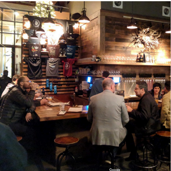
CELLARMARKER BREWING CO.