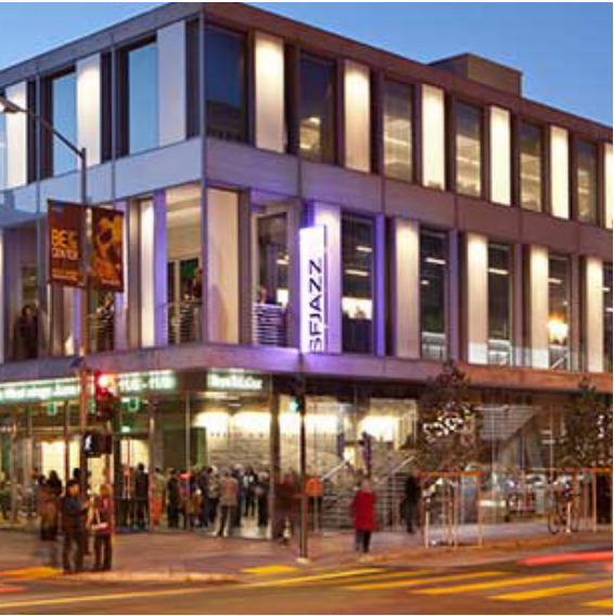
SAN FRANCISCO JAZZ CENTER