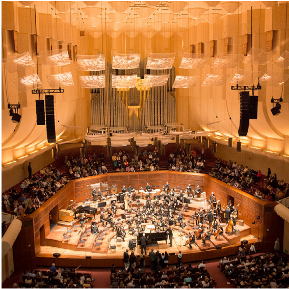
DAVIS SYMPHONY HALL