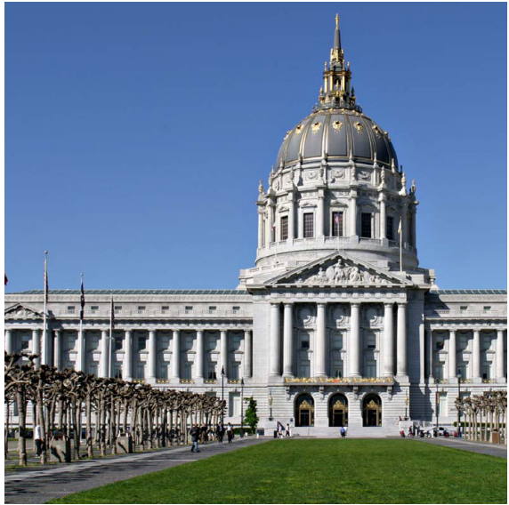
SAN FRANCISCO CIVIC CENTER