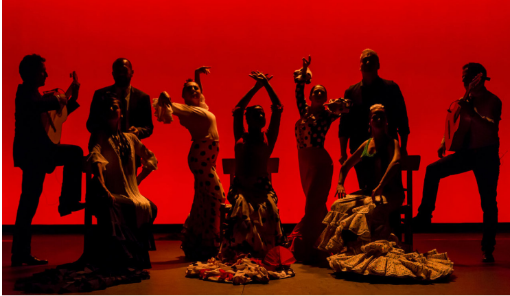
THEATRE FLAMENCO OF SF