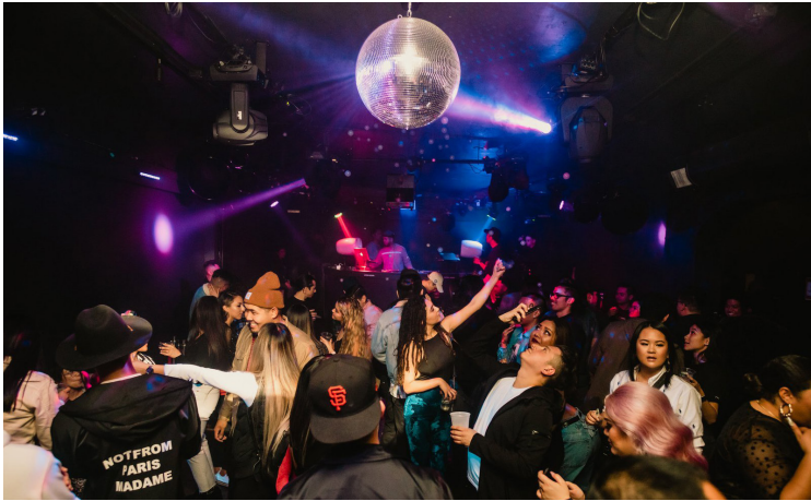
THE VALENCIA ROOM