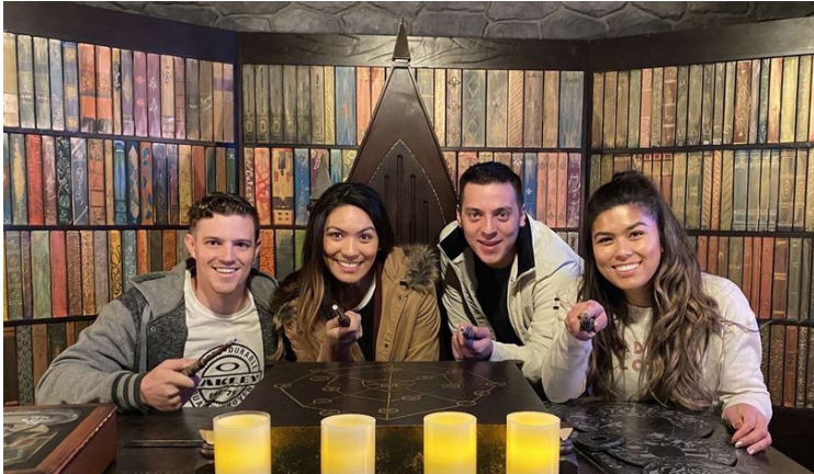
PANIQ ESCAPE ROOM