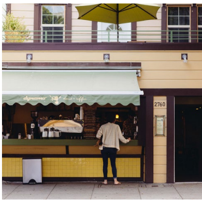
DYNAMO DONUT & COFFEE