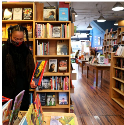
MEDICINE FOR NIGHTMARES