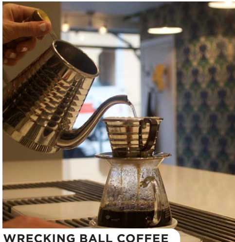
WRECKING BALL COFFEE