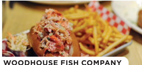
WOODHOUSE FISH COMPANY