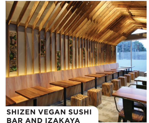
SHIZEN VEGAN SUSHI BAR AND IZAKAYA