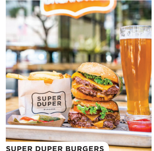
SUPER DUPER BURGERS

The Upper Market / Duboce Triangle neighborhood is a busy corridor between the Lower Haight, Mission, Castro, and Hayes Valley neighborhoods.