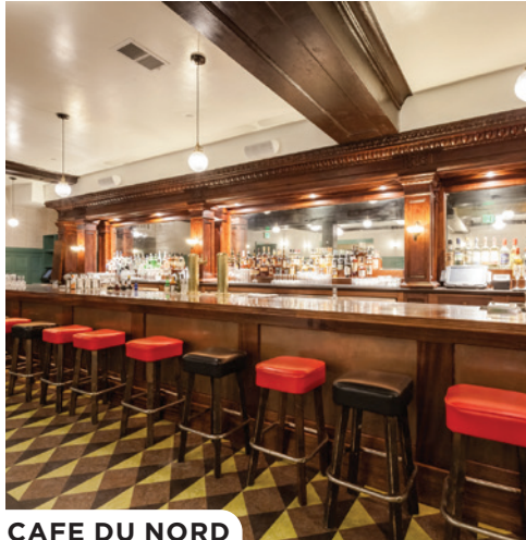
CAFE DU NORD