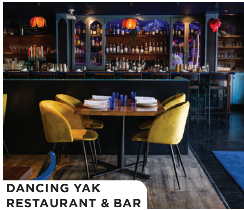
DANCING YAK RESTAURANT & BAR