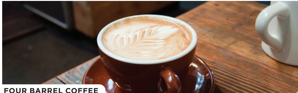
FOUR BARREL COFFEE