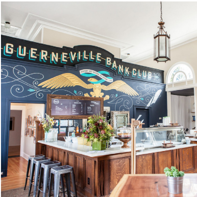
NIMBLE & FINN'S