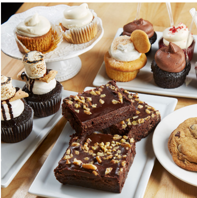
SIFT DESSERT BAR