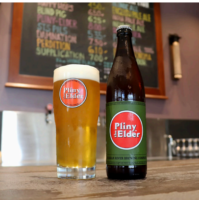
RUSSIAN RIVER BREWING