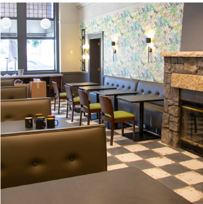
GROSSMAN'S NOSHERY & BAR