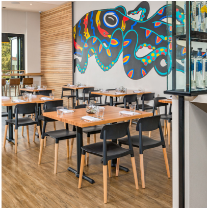
PERCH + PLOW

631 4th Street is located in the downtown area of Santa Rosa county. Lined with historic shop fronts, this is the best place in town to find local, one-of-a-kind stores suiting just about every need. Fourth Street's main shopping area stretches from the Santa Rosa Plaza down to E Street, a few scenic blocks that offer an extra-pleasant walk on a sunny day. Bars, cafés, restaurants ranging from Thai to Indian, and even an English tea room, Tudor Rose.